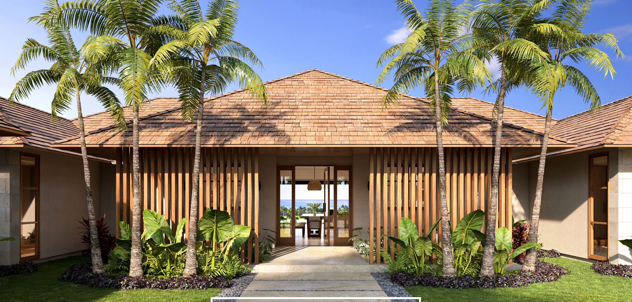
PERFECT H Shown in the "Beach" Style